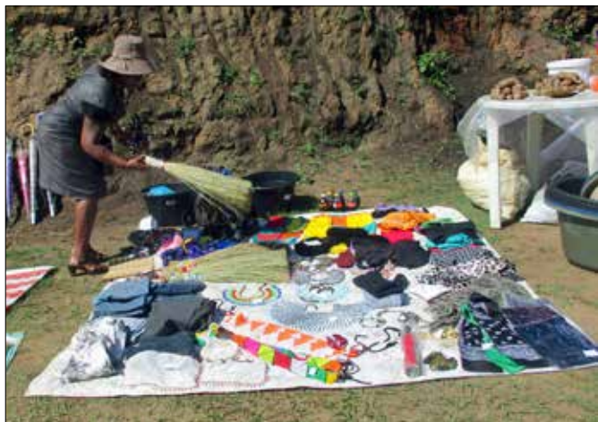
An Asilimeni and market day was held in Egugwini zone in April. Group members came from 9 zones in eThekwini, as well as from 3 other districts where ACAT operates (Maphumulo, Izingolweni and Nhlazuka).